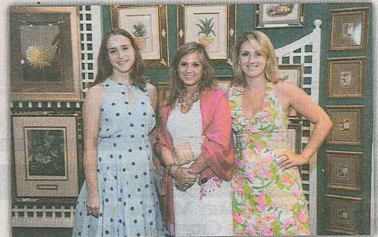
Ladies from Brown Brothers Harriman of Boston, the Gala Preview Party Sponsor